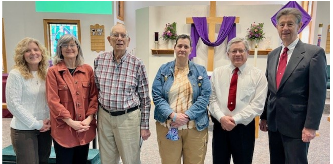
2024 Church Council Members