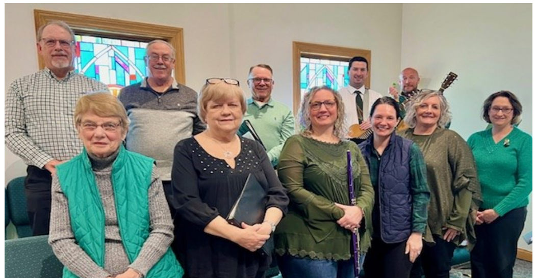
Celtic Praise Team St. Patrick's Day Worship Service