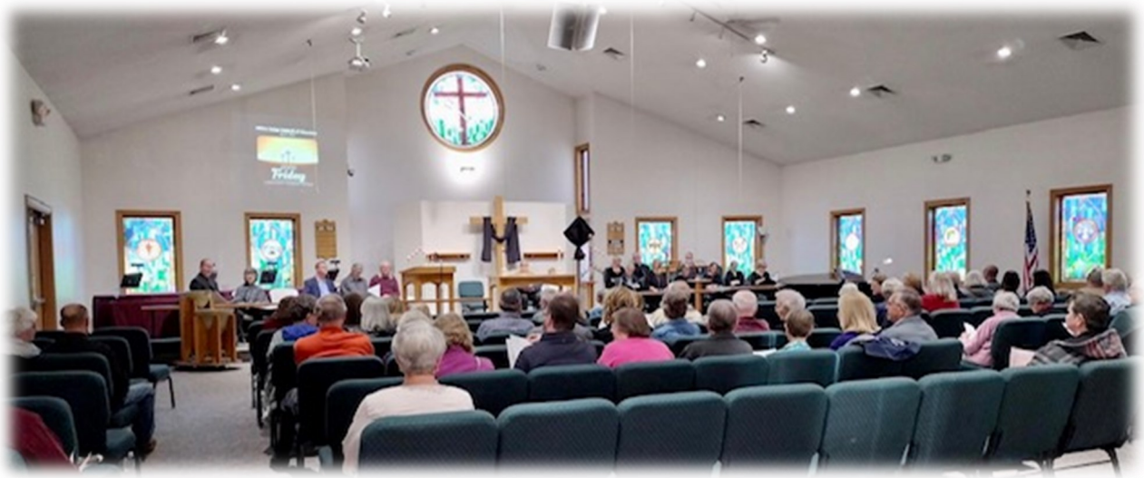
The Milton Union Council of Churches' Community Good Friday Service was held at Good Shepherd Lutheran Church with six pastors and 92 attending .