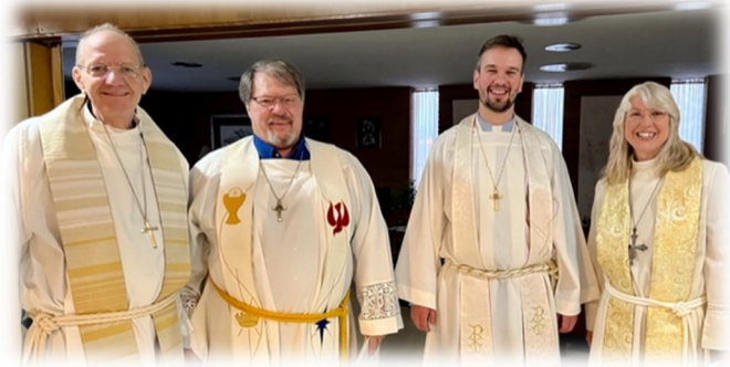
LSIM Saturday Easter Vigil at St. John's Lutheran Church, Vandalia