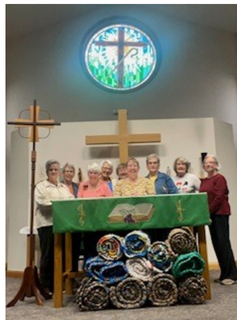
October mats to be blessed and distributed at First Lutheran Church “free room”.