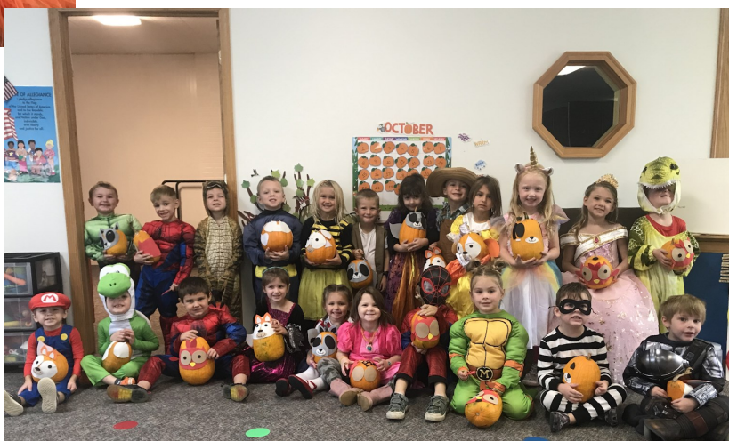
Our four year old class