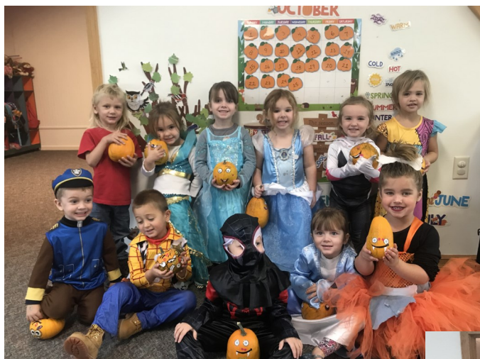
Our three year old class

For the month of November, we will be talking about America and also about Thanksgiving and how it came to be.