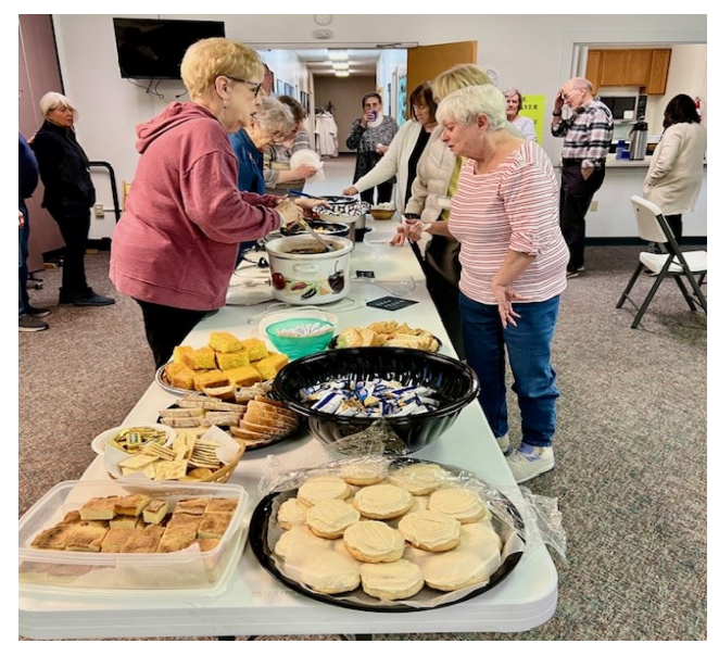
on February 21, 2024 Thanks to everyone who provided soup and other food for the Wednesdays in Lent.