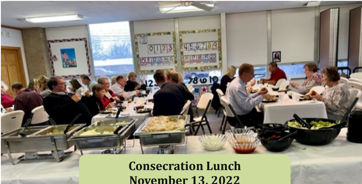
Consecration Lunch November 13, 2022