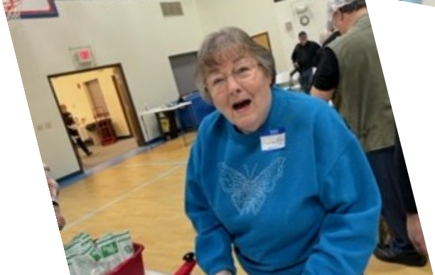
LSIM Food Packing Event to aid Ukraine held on Saturday, January 21 at Abiding Christ