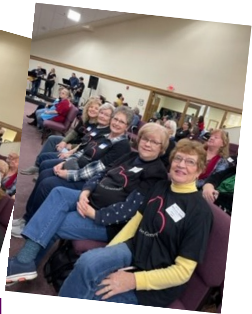
More than 150 volunteers, 14 from GSLC, helped create 28,000 packaged meals for displaced people and refugees in Ukraine on Saturday at the Abiding Christ Lutheran