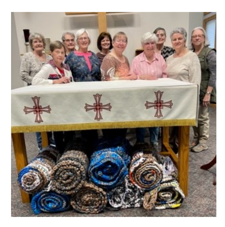
The plarning mats were blessed on April 23, 2023. These mats will be taken to First Lutheran Church for the homeless in Dayton to use. Thanks to our plarning group and everyone who donates items for the homeless.

Save the Date! Sunday, June 11 - church service at 10:30 a.m. at the Lange Estate at 3505 Calumet Road, Ludlow Falls. Picnic lunch and games will follow. We have the shelter reserved from 9 a.m. to 2 p.m. Bring a covered dish to share. More information to follow.